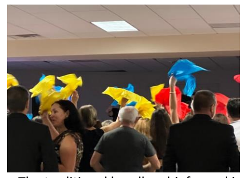
The "hora" dance