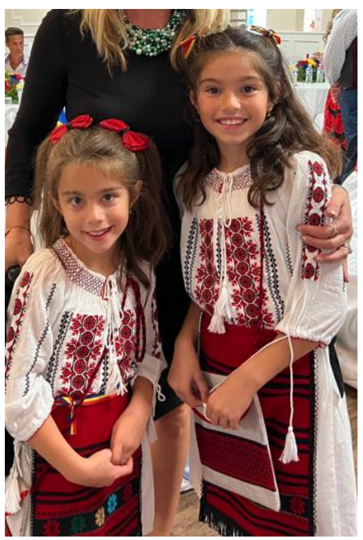
Two little girls in Romanian folk costumes and the traditional" ie, "blouse"

Romanian music and from other European countries as well as American music, pop and popular music were played, in a successful musical show for all tastes and all ages. The hora was danced, but also "Brasoveanca", "Dansul Pinguinului" and Macarena. For the Hora dance, red, yellow, and blue paper handkerchiefs were distributed to people at the tables. This was another nice note to mark the Romanian character of the event.