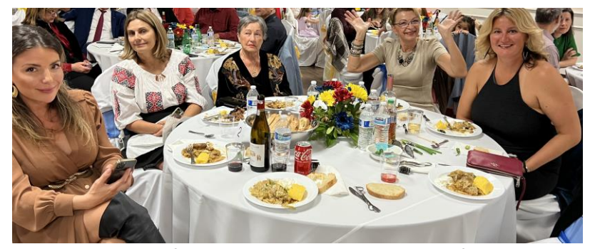
Delicious food. A real traditional Romanian feast.

There is also the aspect that we are used to Romanian community events being organized by older people, making us think that only they are interested in meeting each other, to soothe their nostalgia. But this event showed that there are also young people passionate about Romanian values. How nice!